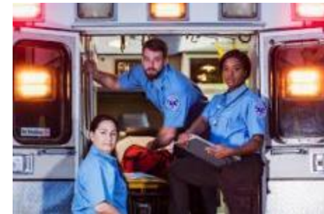
Emergency Medical Technician (EMT)