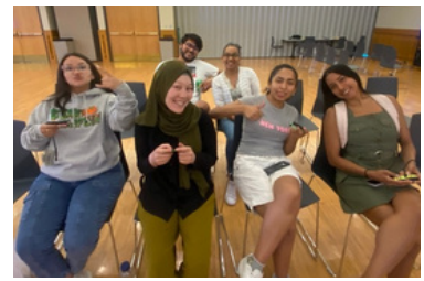
VIDEO GAME TOURNAMENT