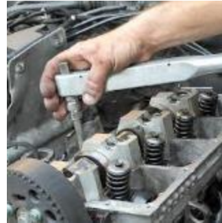
Heavy Duty Diesel