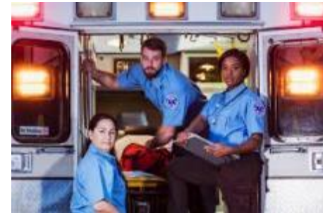
Emergency Medical Technician (EMT)