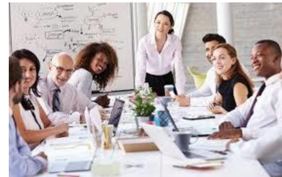
Business Leadership/ Project Management