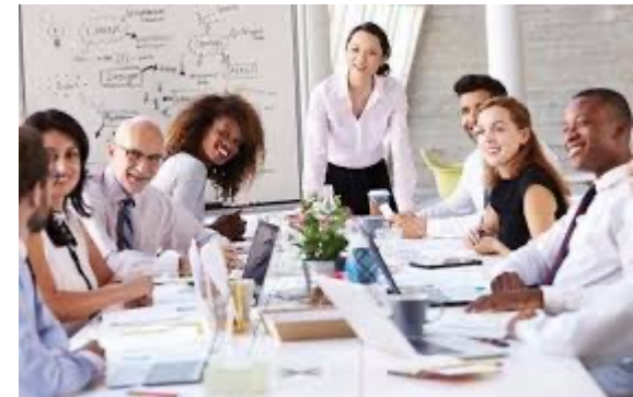
Business Leadership/ Project Management