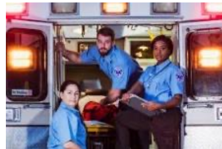
Emergency Medical Technician (EMT)