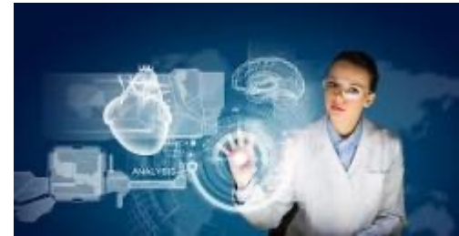
Medical Innovations Pathway