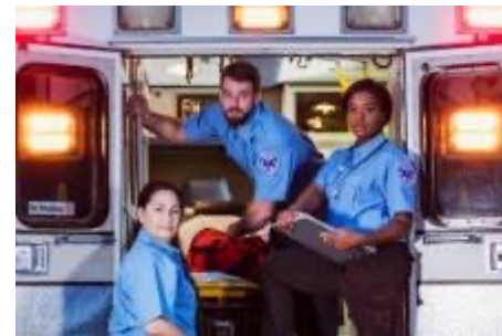
Emergency Medical Technician (EMT)