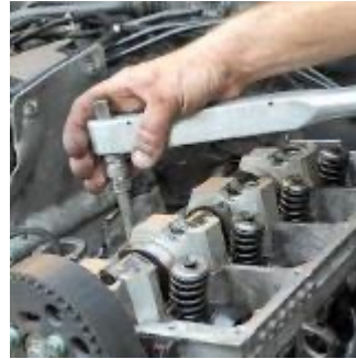
Heavy Duty Diesel