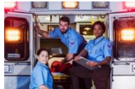
Emergency Medical Technician (EMT)